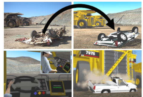
Accident scenarios are faithfully recreated.

What are the experts saying about Learn with Harry ?