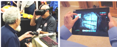
Our software supports a variety of training situations, environments, and technologies.