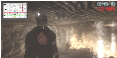
Learners face a variety of hard choices — and often unexpected consequences.