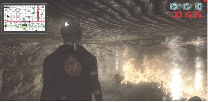
Fig. 2. Harry's Hard Choices. Save a crew of miners ( top ) from an unfolding disaster featuring smoke, fire, lethal gases, ground falls, faulty equipment, and many other hazards ( bottom ).